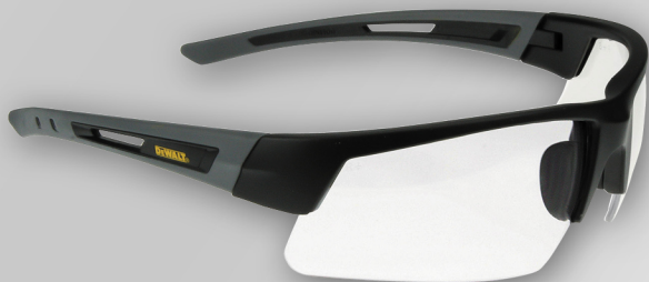
DPG100-1 Clear lens