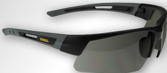
DPG100-2 Smoke lens

Copyright ©2014 DEWALT. DEWALT is a registered trademark of DEWALT Industrial Tool Co., used under license. All rights reserved. The yellow and black color scheme is a trademark for DEWALT power tools and accessories. Trademark License: Radians, Inc., Memphis, TN 38141, 877-723-4267, www.radians.com. A licensee of DEWALT Industrial Tool Co.